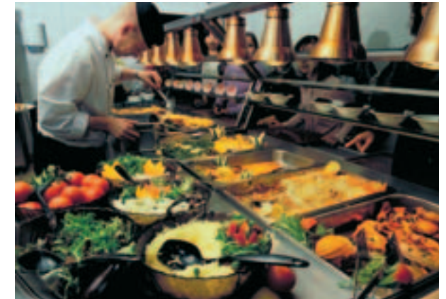
An extensive catering service may be provided

Cardiff Bay is an exciting development and includes a visitor centre, which gives information on the Bay's development, past, present and future. Why not take a stroll and visit one of the many restaurants and bars, sit and watch the world go by over a drink or cup of coffee. Children will enjoy Techniquest with the interactive exhibits, planetarium and science theatre. We also have a Norwegian Church, which was the first church built outside Norway for its mariners. This is now a coffee shop and arts centre and is well worth an hour of your time. The Atlantic Wharf Leisure Village has a 12 screen cinema, ten pin bowling, restaurants and bars and an on-site brewery. The Bay is now the home of the Welsh Assembly which is housed also in a specially commissioned 21st century building.