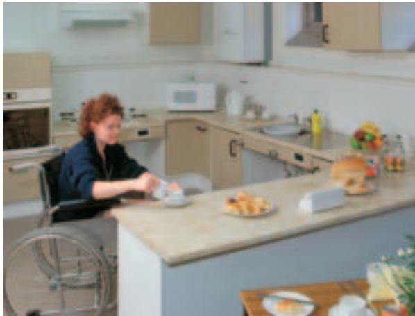
There are limited disabled facilities

The Cardiff & Region Discount Card is music to visitors' ears. It has been launched to help celebrate Cardiff's centenary as a city and 50th year as capital of Wales.