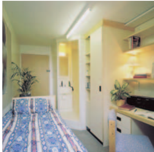
Cardiff University has more than 3000 en-suite bedrooms which are ideal for individuals, families and groups visiting Cardiff

Cardiff benefits from excellent road and rail links with Britain's other major towns and cities. London for example, is only 100 minutes away by train and the M4 motorway links both the west and south of England, as well as west Wales. Travel from the midlands and the North is equally convenient: the journey by road from Birmingham, for instance, taking only 2 hours.