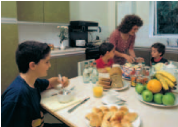
Families can have breakfast together in the privacy of their own flat

All rooms offer single occupancy accommodation with en-suite facilities, and are grouped into small flats. Each flat has a shared, fully fitted kitchen with cooker, fridge freezer, cooking and eating utensils and dining area. All rooms are provided with linen and towels and refreshments are made available in the kitchen area.